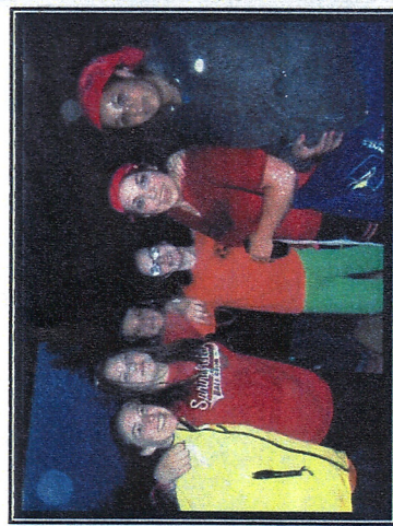
Low Ropes course

Please Contact Your Campus Life Director at 815.935.2020